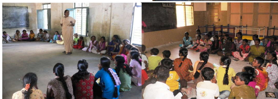
Particulars of NCP Trainings: Table 1