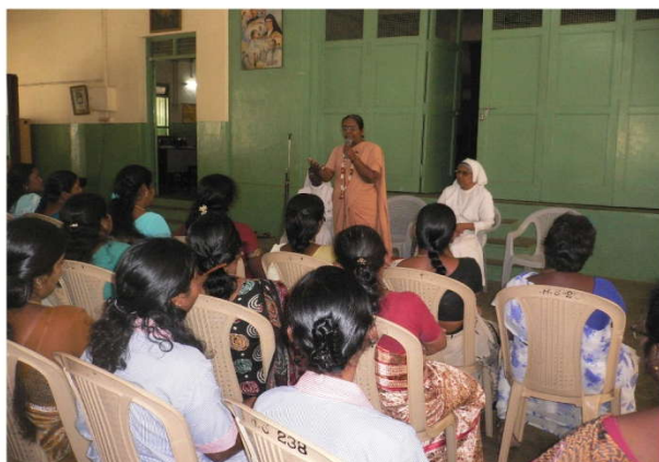
Provincial's Visit - February 2012