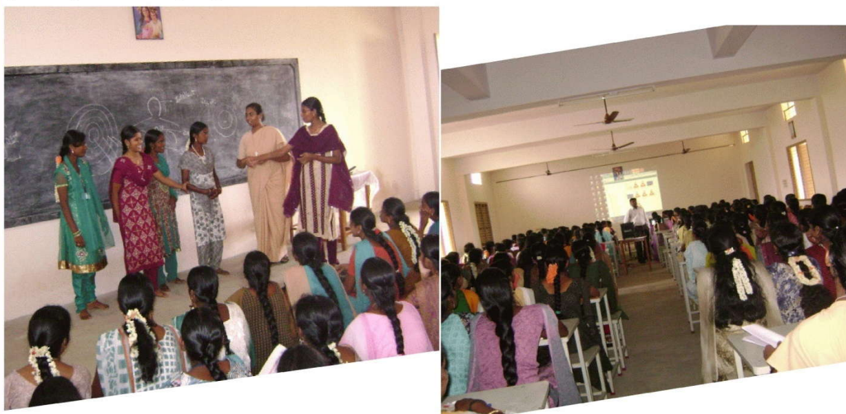
Particulars of Motivation & Career Assessment Programs: Table 2

To motivate the students to be focused onto their aim and ambition, to develop a positive mind and attitude towards life-experiences and to guide them in their decision-making with regard to their career 'Motivation and Career Assistance' programmes were given to the students of Formal and Non-formal Education. Altogether 470 Students participated in the programme.