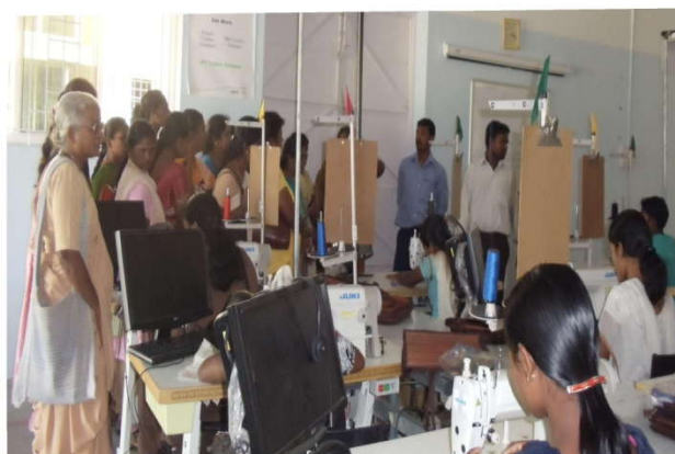
Particulars of Leadership & Entrepreneurship for Women: Table 4